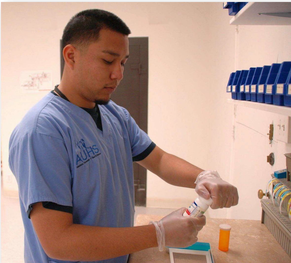
Prescription Dispensing Laboratory

Praise the LORD. Praise God in his sanctuary; praise him in his mighty heavens. Praise him for his acts of power; praise him for his surpassing greatness. Praise him with the sounding of the trumpet, praise him with the harp and lyre, praise him with timbrel and dancing, praise him with the strings and pipe, praise him with the clash of cymbals, praise him with resounding cymbals. Let everything that has breath praise the LORD. Praise the LORD. ~Psalm 150:1-6