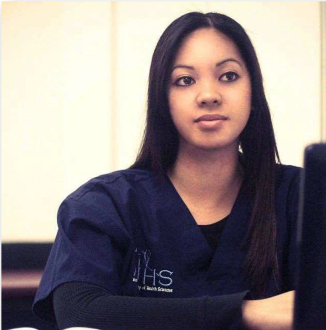
Student, School of Nursing during lecture

“I pray that out of his glorious riches he may strengthen you with power through his Spirit in your inner being, so that Christ may dwell in your hearts through faith. And I pray that you, being rooted and established in love, may have power, together with all the Lord’s holy people, to grasp how wide and long and high and deep is the love of Christ, and to know this love that surpasses knowledge—that you may be filled to the measure of all the fullness of God.” ~Ephesians 3:16-19