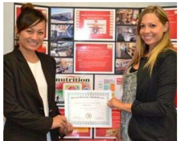
B.S. in Nursing, Student Poster Session

A degree program that is unaccredited or a degree from an unaccredited institution is not recognized for some employment positions, including, but not limited to, positions with the State of California. Student enrolled in an unaccredited institution is not eligible for federal financial aid programs.