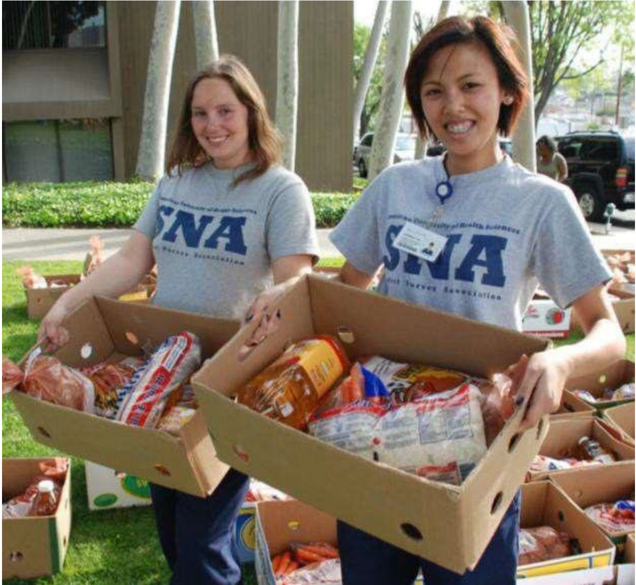
Nursing Students giving away meals for the “Acts of Love” holiday event.

There is a dream that each of us has inside. It speaks of a better time, of a better life, of a better world. There is a voice that comes from God and shows to each, “the way”, then say, “come abide.” There is a need that cries, must be satisfied, requires of us to care, to help, to give, set self aside. That all might have the chance to believe, to learn, to create, to succeed.