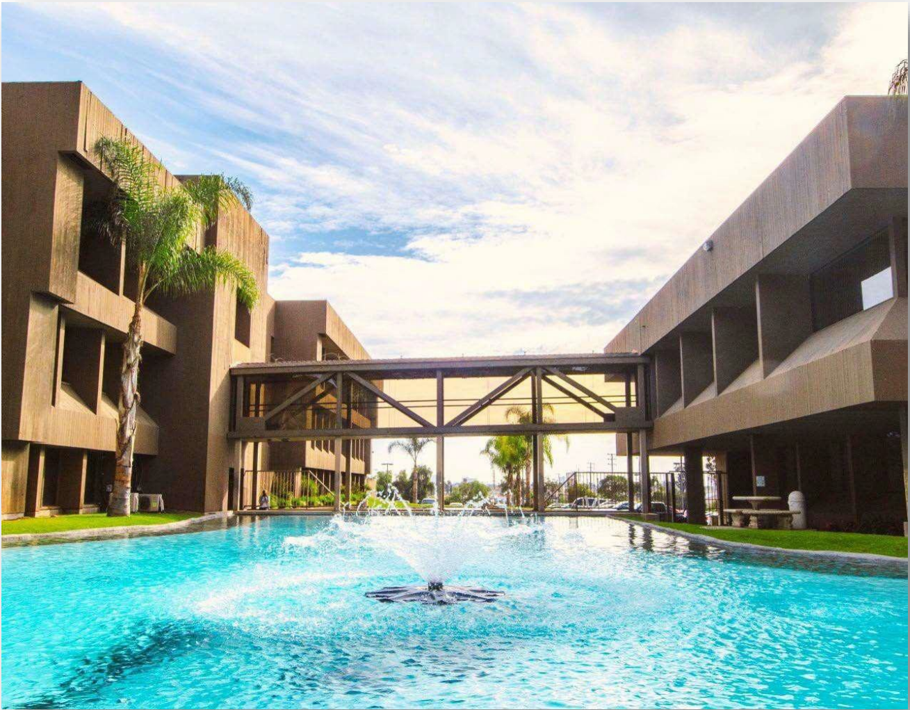
AUHS Building 2 and 3

“Trust in the Lord with all your hearts, and do not lean on your own understanding.” ~Proverbs 3:5