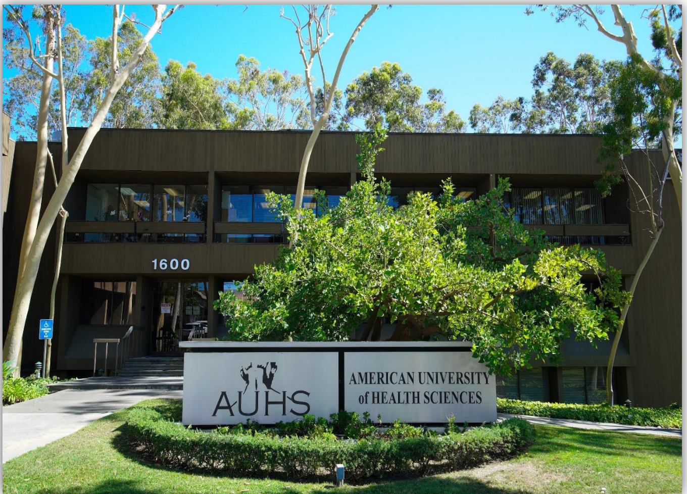
Front Façade, American University of Health Sciences Campus

“How blessed is the man who does not walk in the counsel of the wicked, nor stand in the path of sinners, nor sit in the seat of scoffers! But his delight is in the law of the LORD, and His law he meditates day and night. He will be like a tree firmly planted by streams of water, which yields its fruit in its season and its leaf does not wither; and in whatever he does, he prospers.” - Psalm 1:1-3