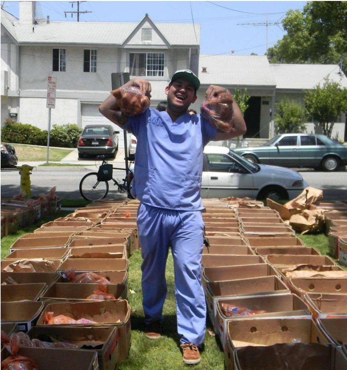
Annual Thanksgiving Food Drive

What good will it be for someone to gain the whole world, yet forfeit their soul? Or what can anyone give in exchange for their soul? ~Matthew 16:26