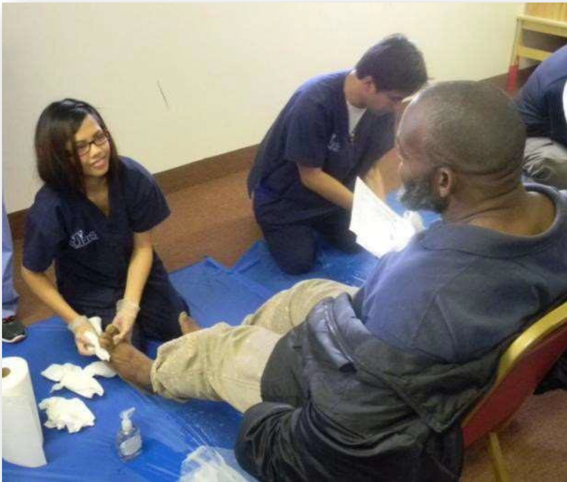
Community Service-A Core AUHS

“On the parable of the Good Samaritan: "I imagine that the first question the priest and Levite asked was: 'If I stop to help this man, what will happen to me?' But by the very nature of his concern, the good Samaritan reversed the question: 'If I do not stop to help this man, what will happen to him?'” ~Martin Luther King Jr., Strength to Love