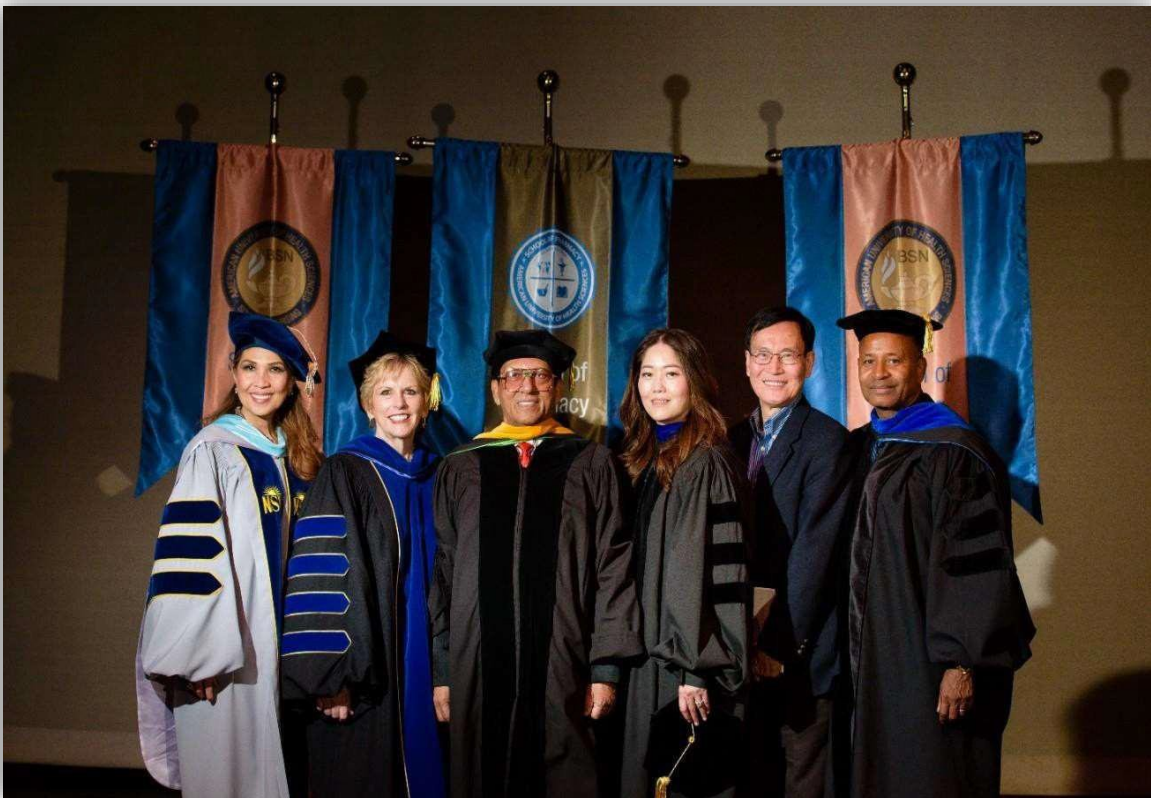
AUHS Commencement 2018

“Therefore, my dear brothers, stand firm. Let nothing move you. Always give yourselves fully to the work of the Lord, because you know that your labor in the Lord is not in vain.” ~1 Corinthians 15:58