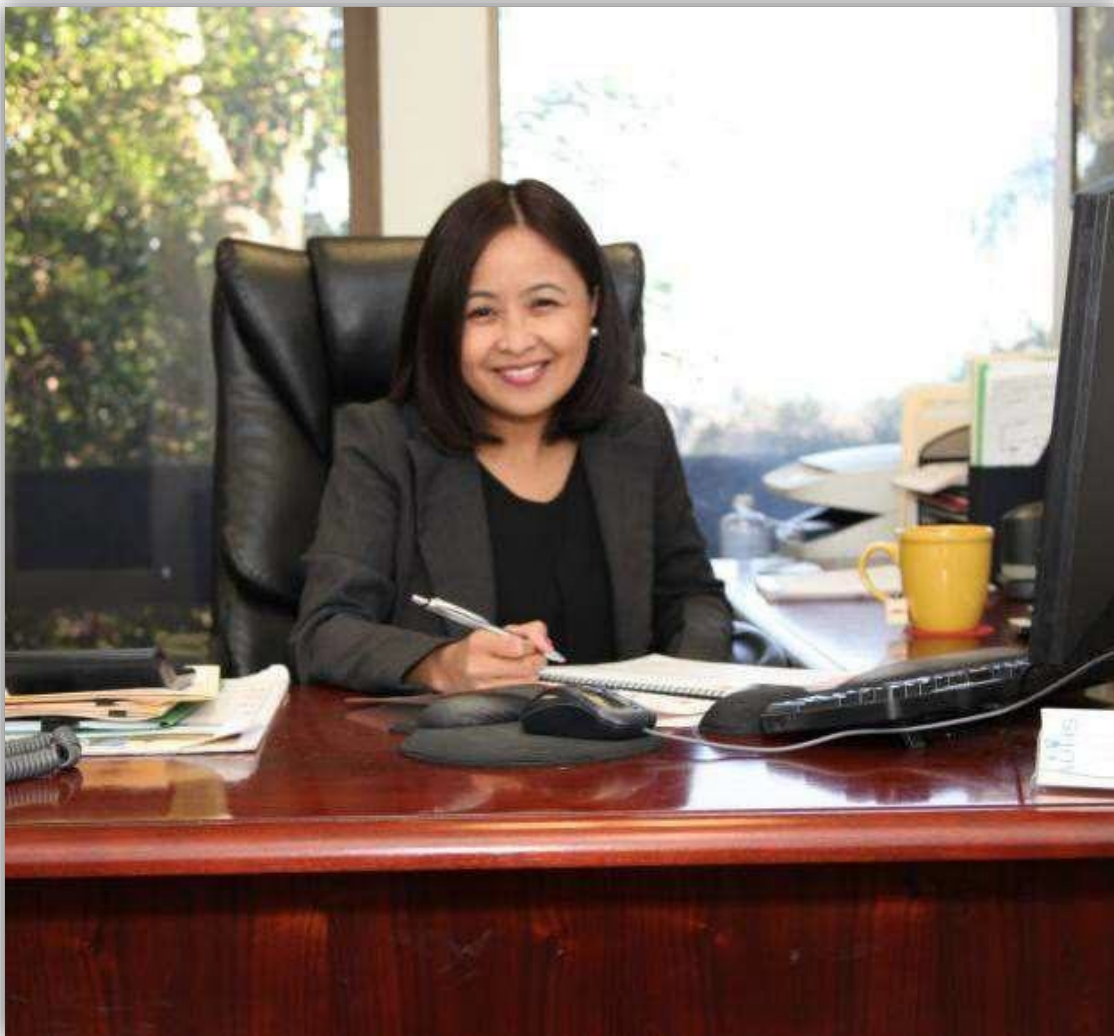
Office of the Student Affairs and Services

“I no longer call you servants because a servant does not know his master’s business. Instead, I have called you friends, for everything that I learned from my Father I have made known to you. You did not choose me, but I chose you and appointed you so that you might go and bear fruit—fruit that will last—and so that whatever you ask in my name the Father will give you. This is my command: Love each other.” ~John 15:15-17